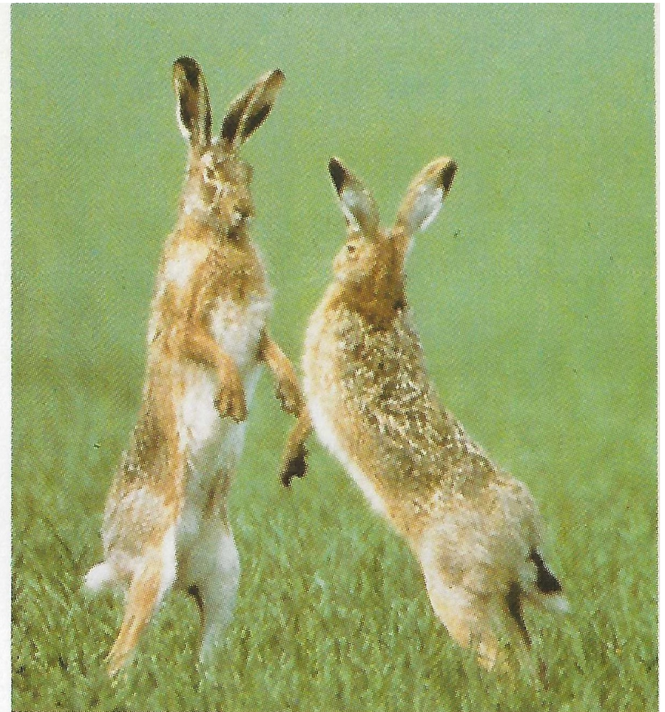
Hares often stand up on their hind legs and paw at each other like boxers. This may be a struggle for social dominance, or a Jill rebuffing a Jack.

Welcome to the March Edition Volume 22 Issue 2 2025