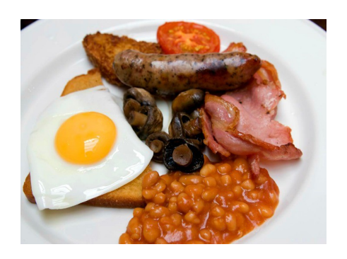
Adults £10 Under 10's £5 Profits raised will be shared between the Hall Funds and the North Devon Hospice.

Start with a choice of Porridge, Cereal or Juice Then the Full English or Pick and Mix Your Favourites All Followed by Tea - Coffee - Toast