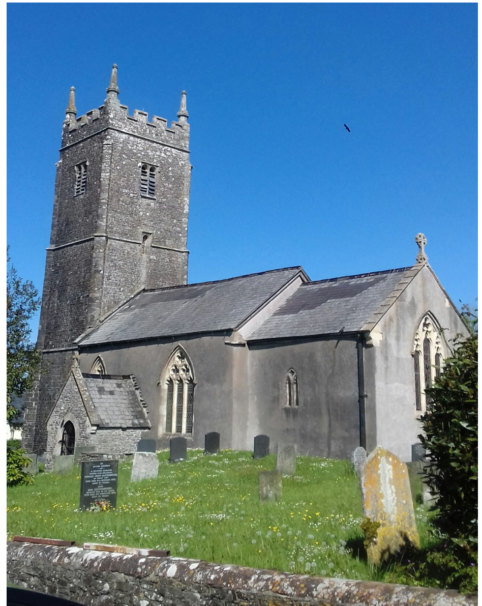
St Mary Magdalene's Church - Huntshaw

Welcome to the October Edition Volume 20 Issue 9 2023