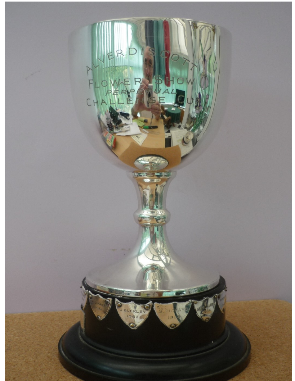
Alverdiscott Flower Show Cup - Won by Pat Broughton in 2023

Welcome to the September Edition Volume 20 Issue 8 2023