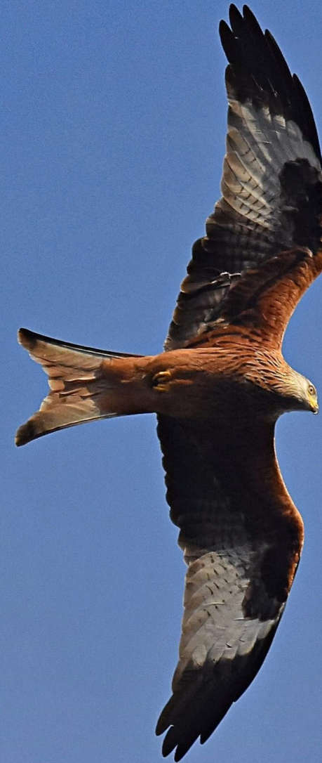
Red Kite by Dave Ward - BirdGuides

Welcome to the September Edition Volume 19 Issue 8 2022