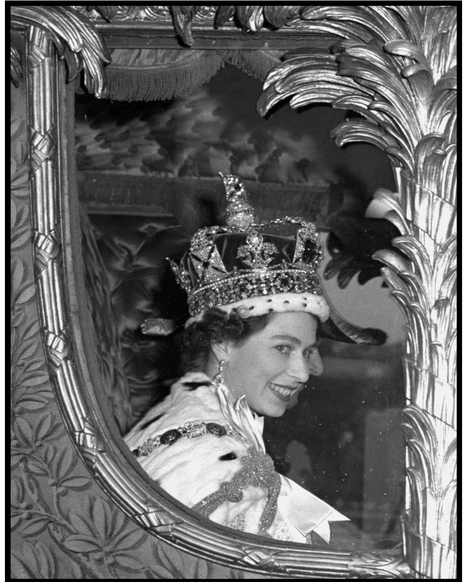
2nd June 1953. The Queen Leaves Westminster Abbey After Her Coronation

Welcome to the October Edition Volume 19 Issue 9 2022