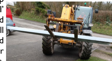
The Beams being delivered to the door in March.