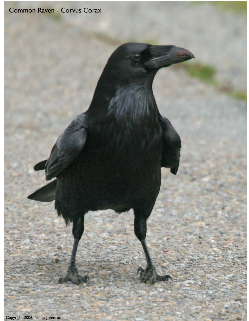
Common Raven - Corvus Corax

Welcome to the June Edition Volume 18 Issue 5 2021